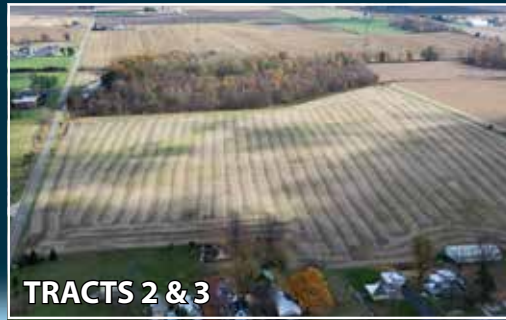
TRACTS 2 & 3