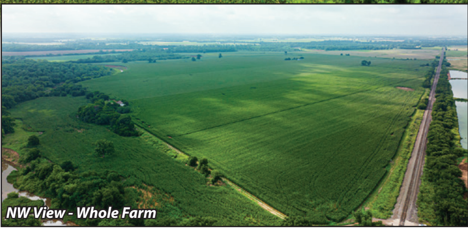
NW View - Whole Farm