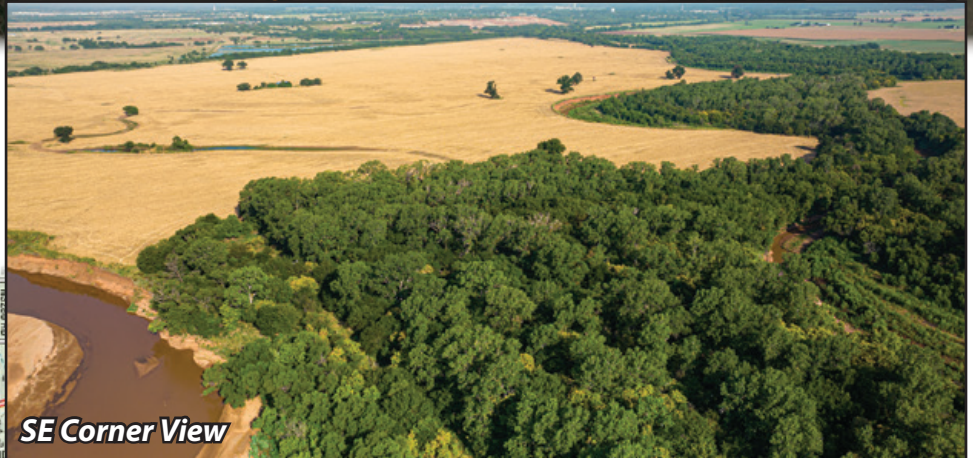
SE Corner View